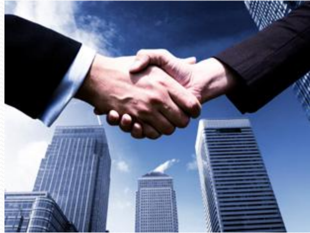
77we Gets Approval